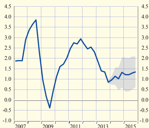
Euro area real GDP 2) (quarter-on-quarter percentage changes)