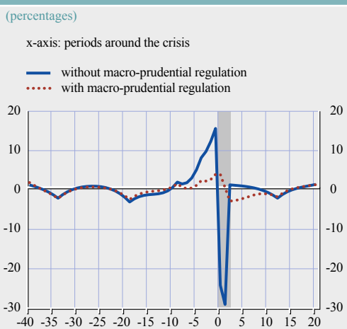
Chart C.2 Externalities over the credit cycle

Notes: Simulation of the credit (Hodrick-Prescott) cycle around the typical banking crisis (period 0) in the Boissay-Collard-Smets (2013) macro model. The blue line denotes the decentralised equilibrium allocation (without policy intervention) around banking crises (period 0). The dotted red line denotes the central planner allocation around the same dates. The difference between the two allocations reflects the role of externalities in the model. The underlying economic fundamentals are the same in the two cases.