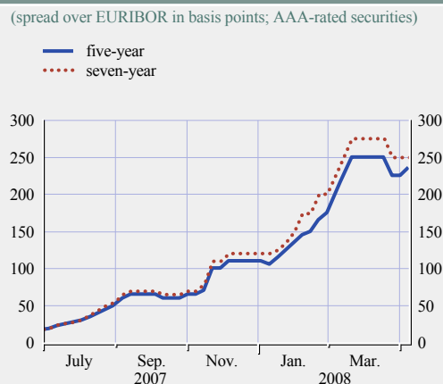
Chart B Commercial mortgage-backed securities spreads in Europe

Note: Data for 2008 are forecasts (marked with *).