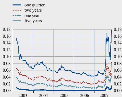
Chart A Implied probabilities of two or more global and euro area large and complex banking groups defaults over different time horizons