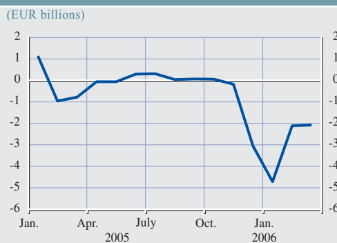
Chart B6.2 German real estate funds, monthly net inflows