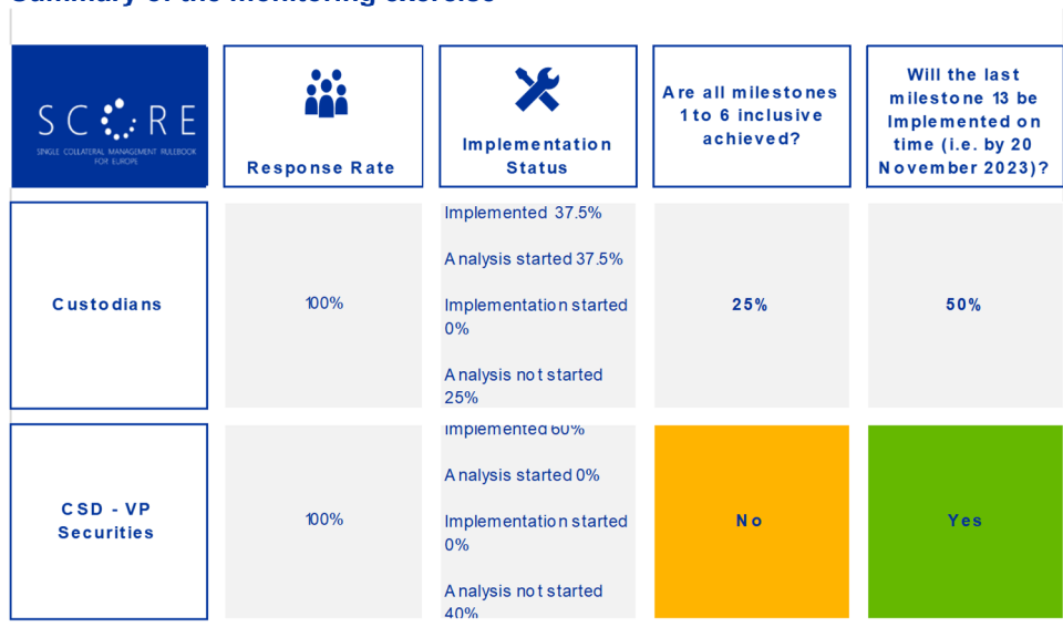
Figure 1 Summary of the monitoring exercise

Some of the reporting entities responded to the survey. VP Securities has implemented most of the standards and will initiate analyses of how to migrate the current billing reporting to ISO20022 by end 2020.