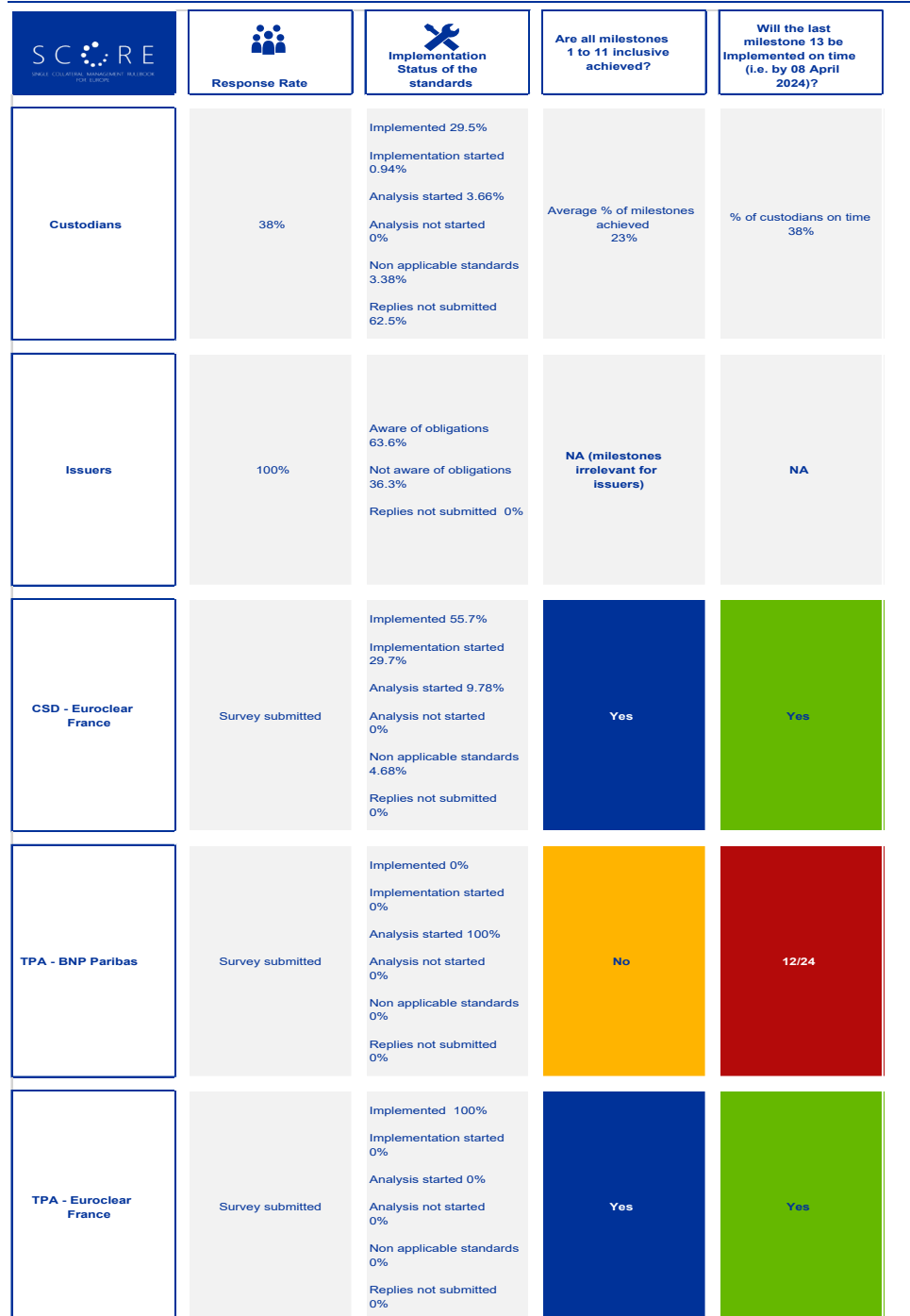
Figure 1 Summary of the monitoring exercise 1

implementation of the standards. This section presents the key findings of the survey for each entity type.