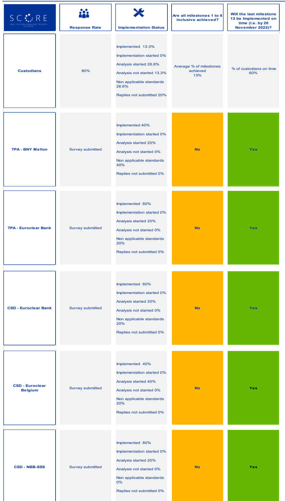
Figure 1 Summary of the monitoring exercise