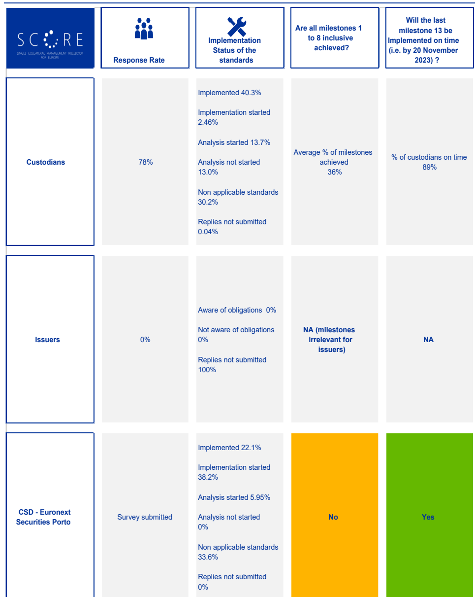
Figure 1 Summary of the monitoring exercise

This section presents the key findings of the survey for each entity type.