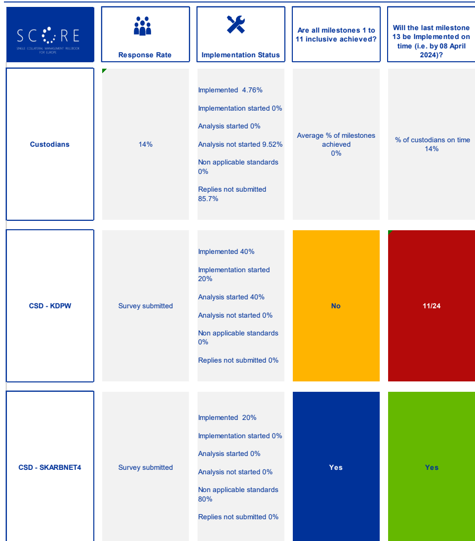
Figure 1 Summary of the monitoring exercise