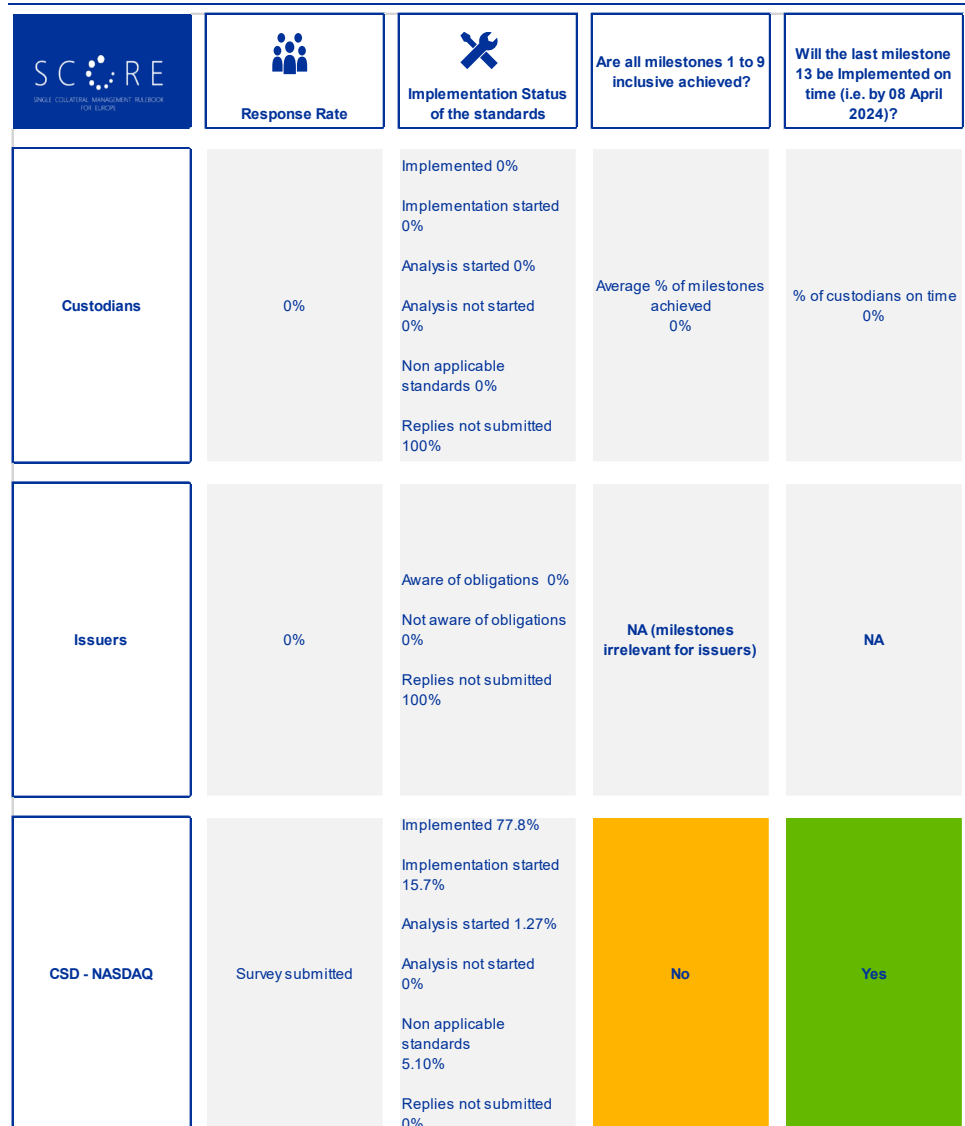
Figure 1 Summary of the monitoring exercise