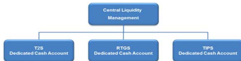
Architecture after T2/T2S Consolidation project