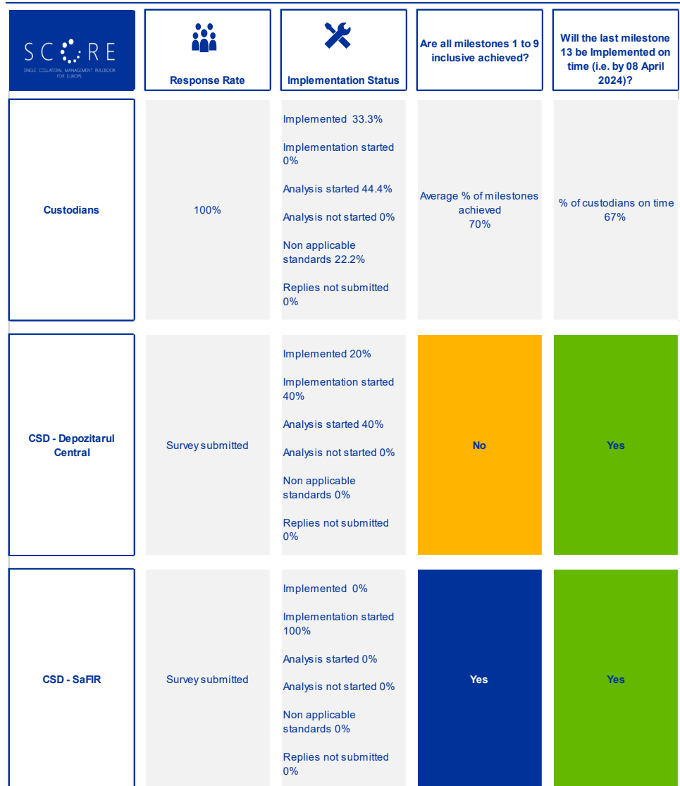
Figure 1 Summary of the monitoring exercise