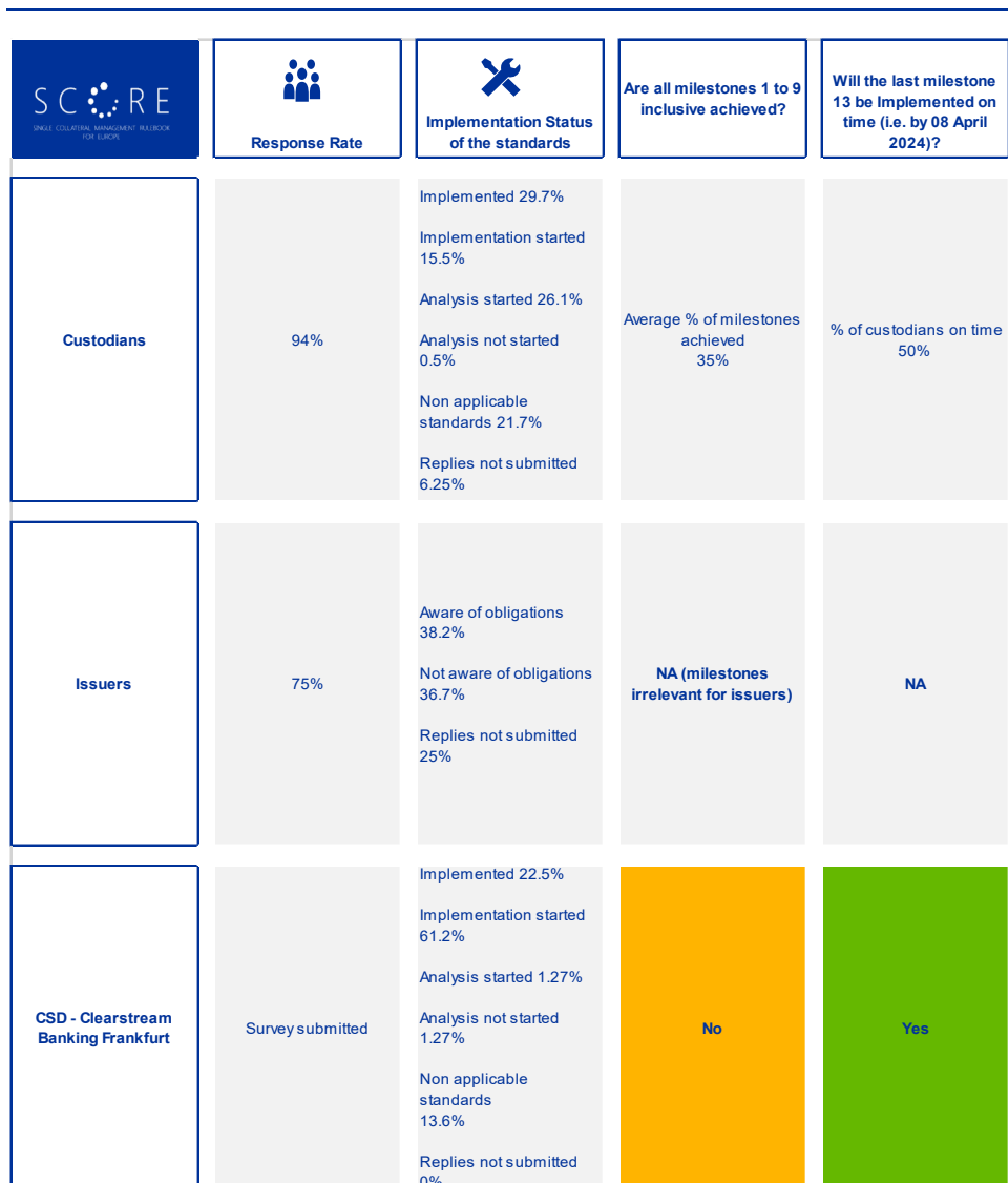
Figure 1 Summary of the monitoring exercise

The overall implementation of the Corporate Actions Standards in the German market is mostly on track; however, a more detailed view shows a mixed image.