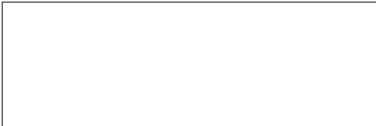
Figure 1 - Context diagram for Central Liquidity Management

[Description of the business processes within the Business Domain, which should be shown as boxes in the diagram above, indicating how they relate to the outside world, or each other]