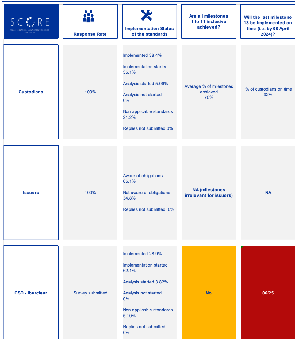
Figure 1 Summary of the monitoring exercise