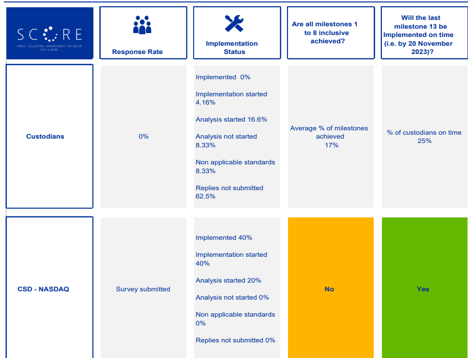
Figure 1 Summary of the monitoring exercise

Nasdaq CSD SE and a quarter of custodians responded to the survey. Responses reflected that implementation has started at limited number of standards more accent putting on analysis of the standards to be implemented. Given the relatively simple and small Baltic financial market, Nasdaq CSD SE together with participants will still consider in detail the usefulness of implementation of standards in national markets.